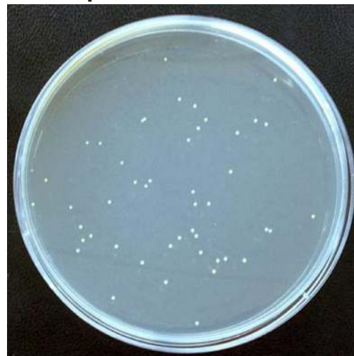
Bacteria Staphylococcus aureus

Calculation of the mop's capacity to pick up bacteria and microorganisms: