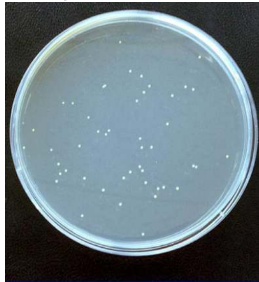
Bacteria Staphylococcus aureus

Calculation of the mop's capacity to pick up bacteria and microorganisms: