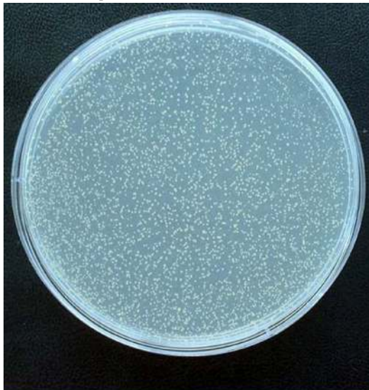
Bacteria Staphylococcus aureus