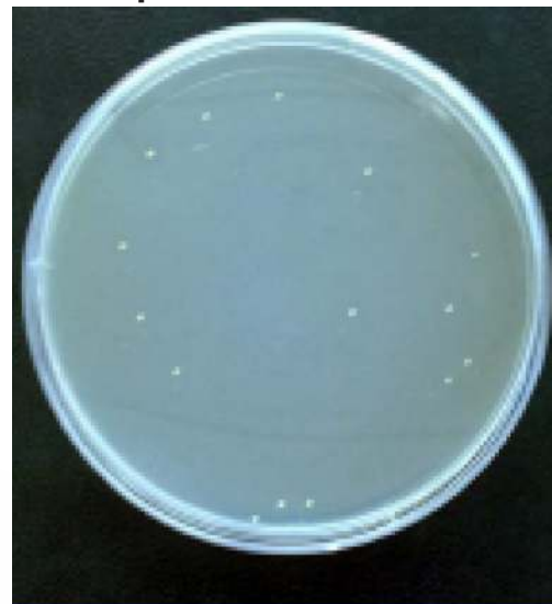
Bacteria Staphylococcus aureus

Calculation of the cloth's capacity to pick up bacteria and microorganisms: